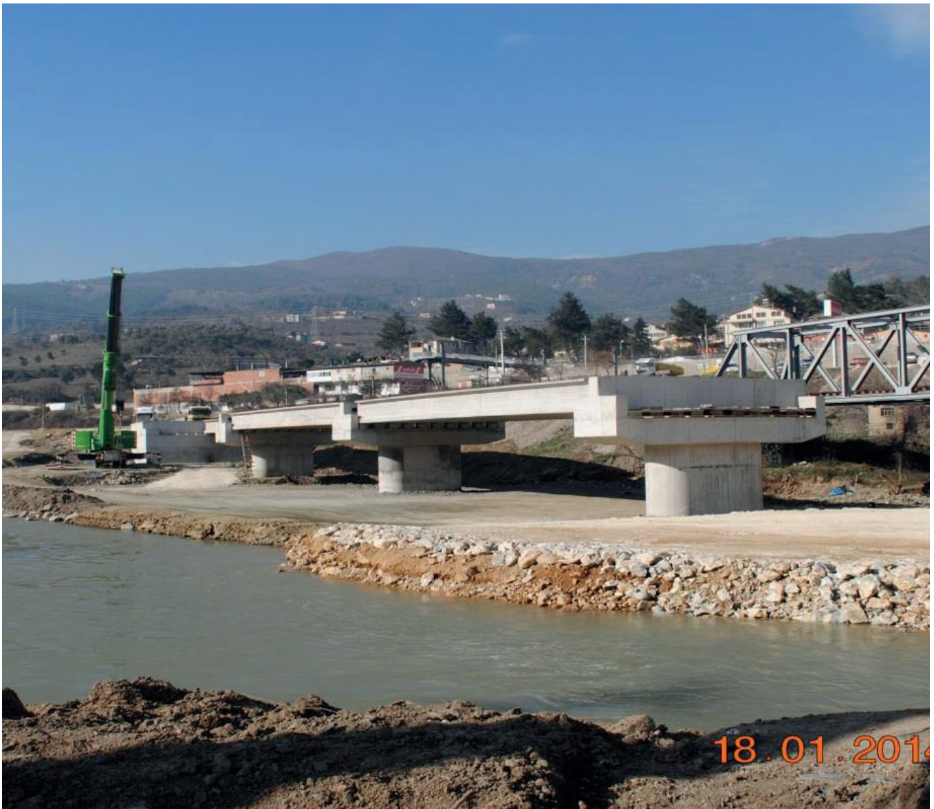
Infrastructure works on railway project between Pamukova-Karaçam by FERMAK Inc., which is among the companies VEO is cooperating with on projects basis