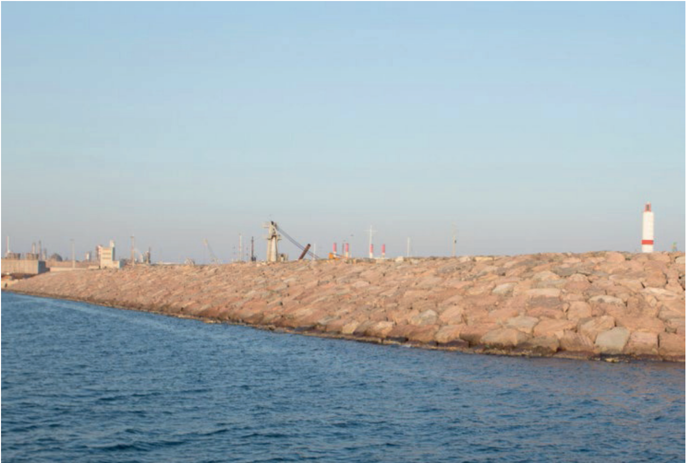
Views from Petkim Container Port project of FERMAK Inc., which is among the companies VEO is cooperating with on projects basis