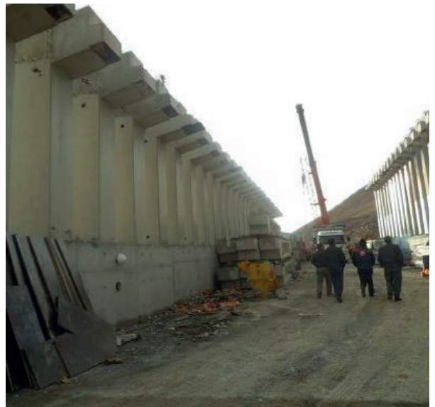
Van – Çat Snow Sheed project of FERMAK Inc., which is among the companies VEO is cooperating with on projects basis