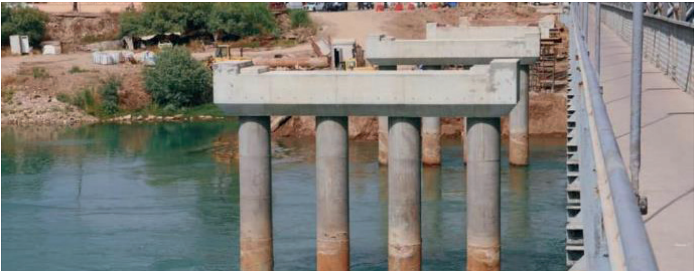
Bridge Project Dicle River at Nineva, Iraq by FERMAK Inc., which is among the companies VEO is cooperating with on projects basis