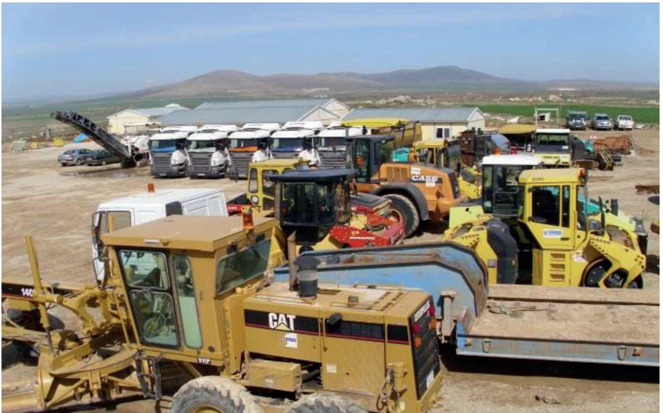
Views from the machinery and equipment park of FERMAK Inc. which is among the companies VEO is cooperating with on projects basis