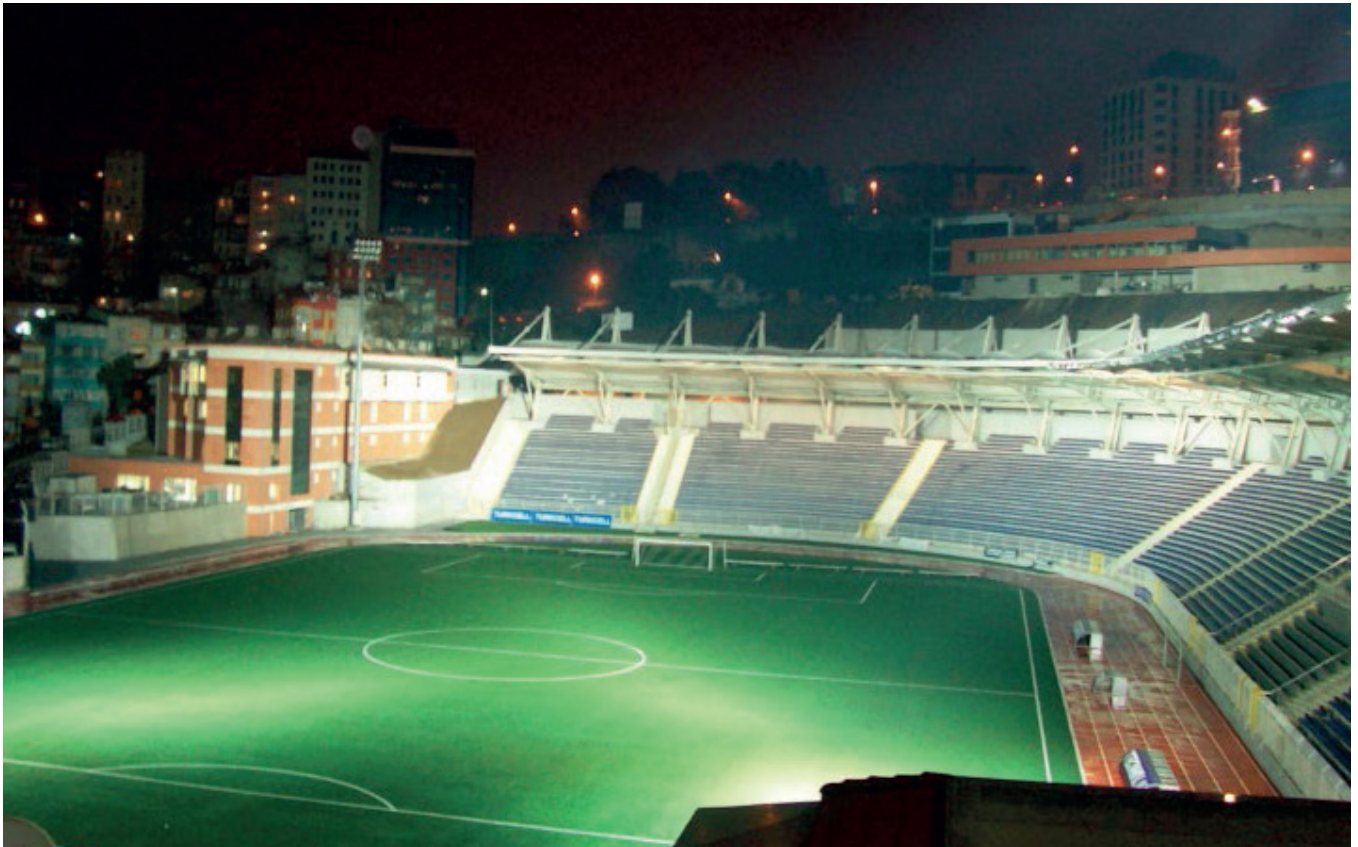
Beyoğlu Sport Complex (Stadium) project of FERMAK Inc., which is among the companies VEO is cooperating with on projects basis