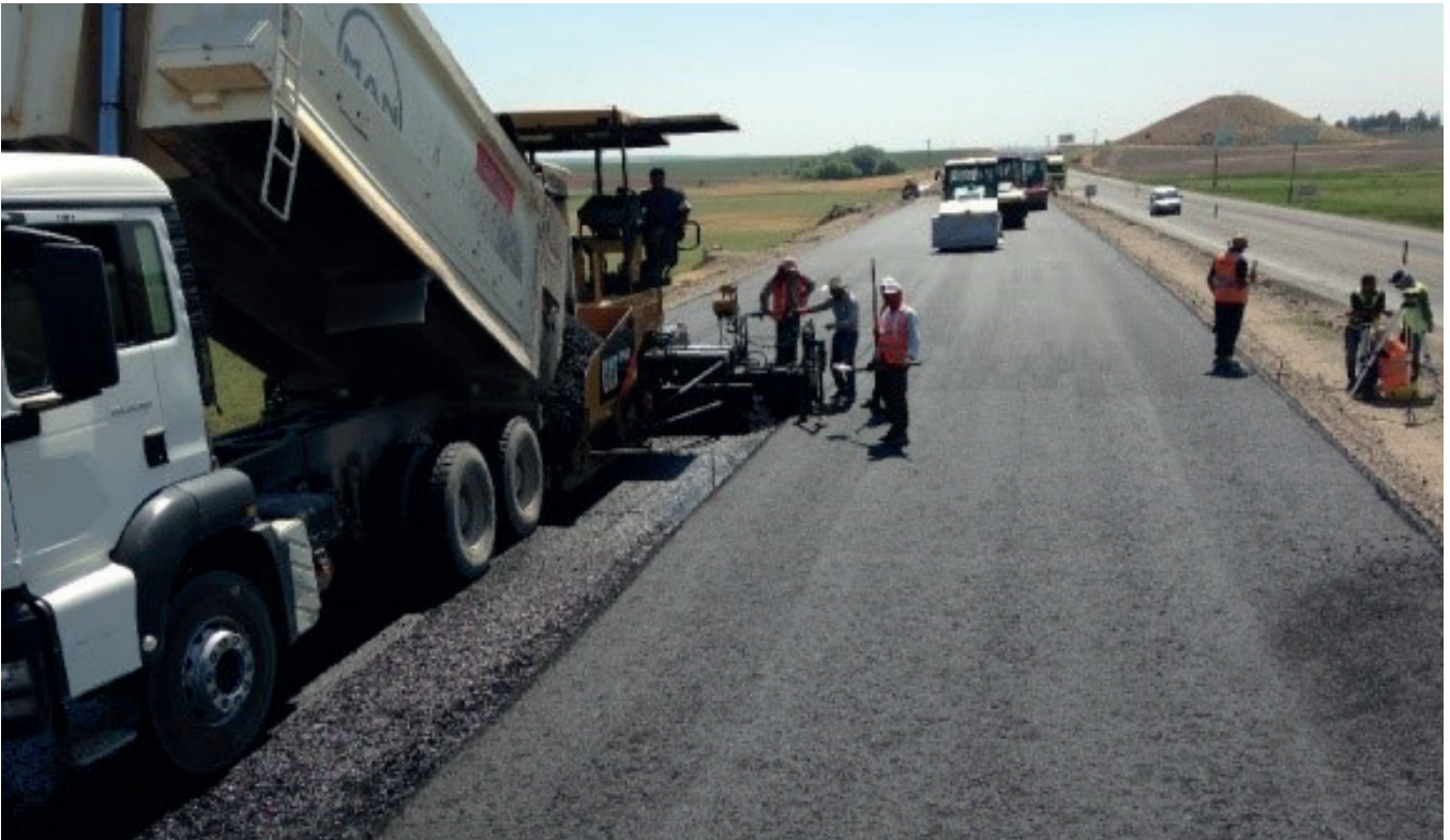
Diyarbakır Bismil Motorway conjunction Project of FERMAK Inc., which is among the companies VEO is cooperating with on projects basis