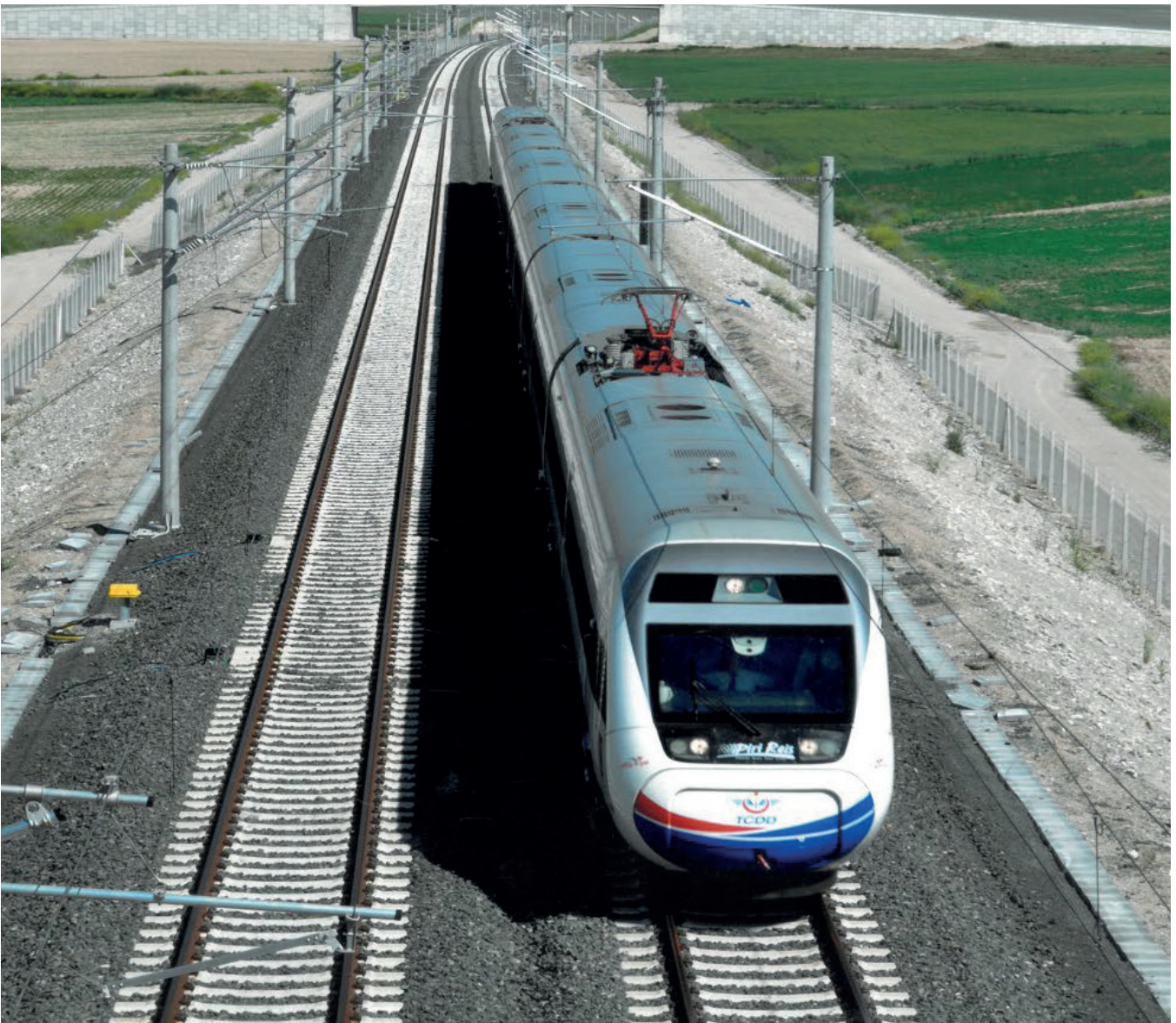
Infrastructure works on 250 KM high railway project between Ankara-Konya by FERMAK Inc., which is among the companies VEO is cooperating with on projects basis