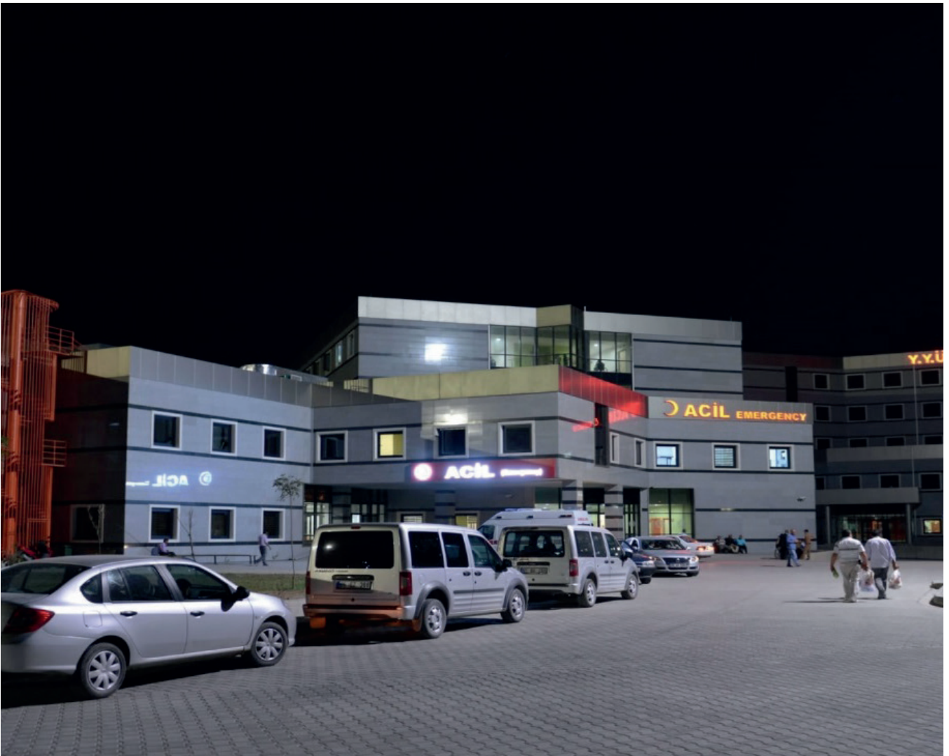
400 bed capacity research and implementation hospital project of FERMAK Inc., which is among the companies VEO is cooperating with on projects basis