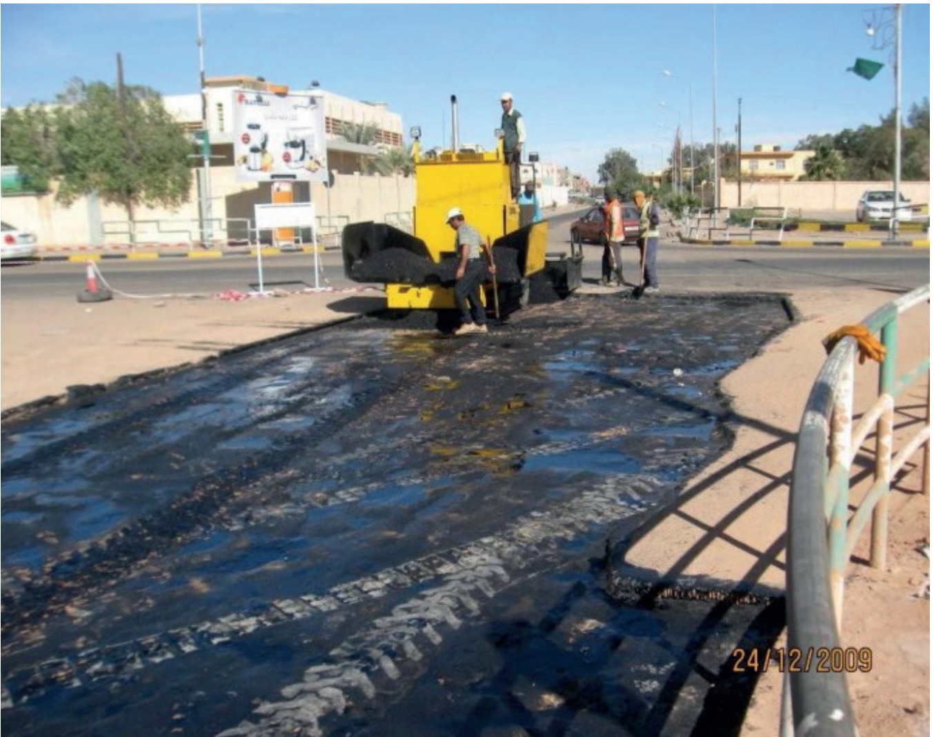
All infrastructure works of regional municipality of Sebiha, Libya by FERMAK Inc., which is among the companies VEO is cooperating with on projects basis