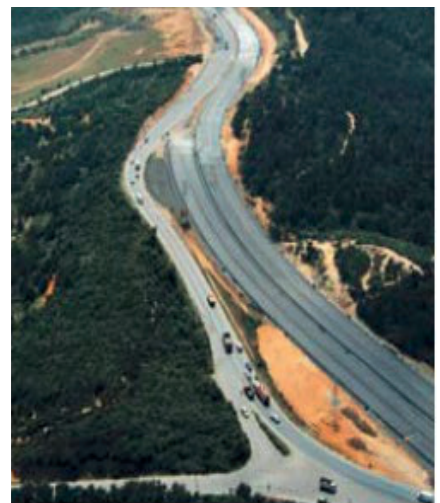
Views from different projects of FERMAK Inc., which is among the companies VEO is cooperating with on projects basis