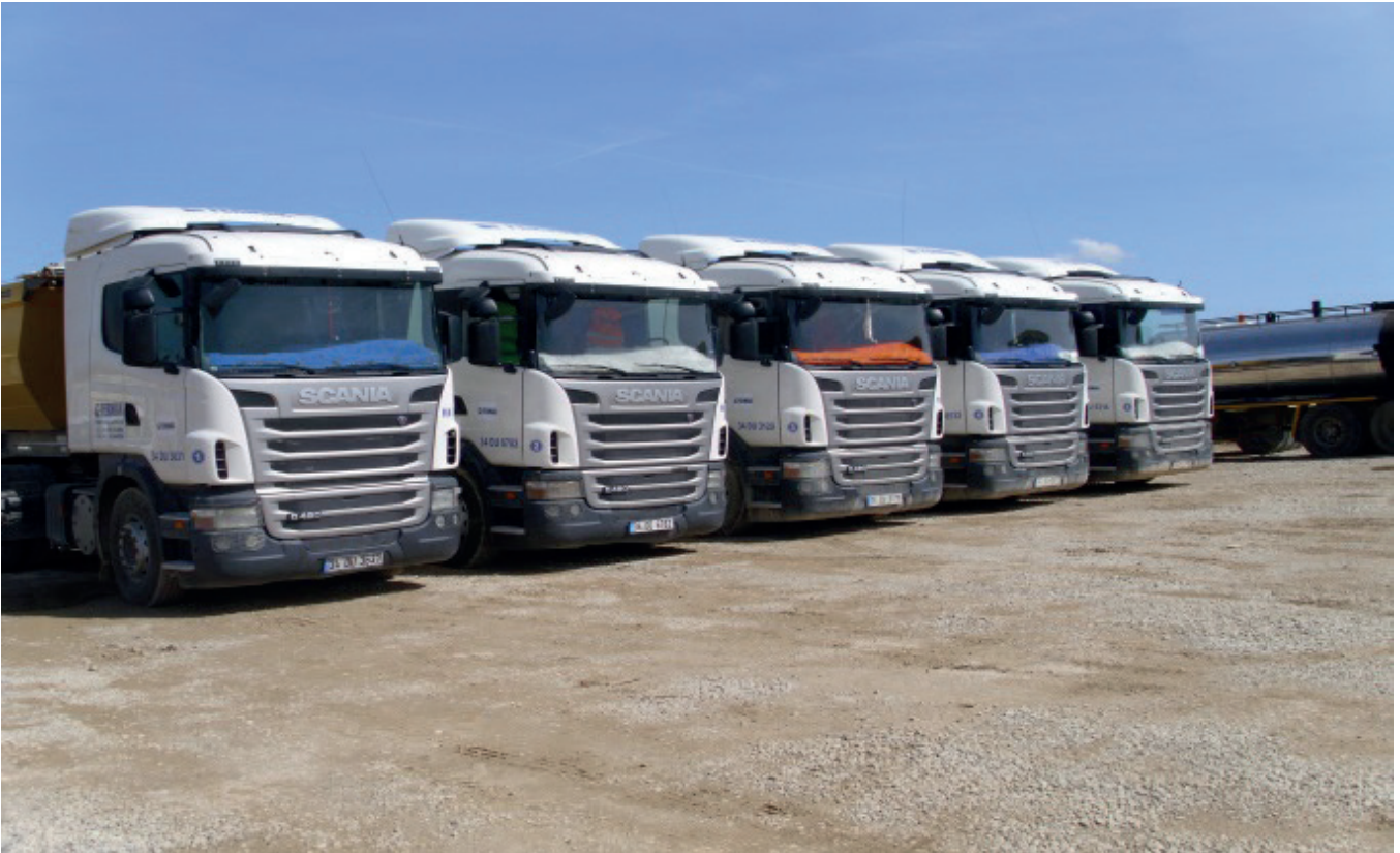
Views from the machinery and equipment park of FERMAK Inc. which is among the companies VEO is cooperating with on projects basis