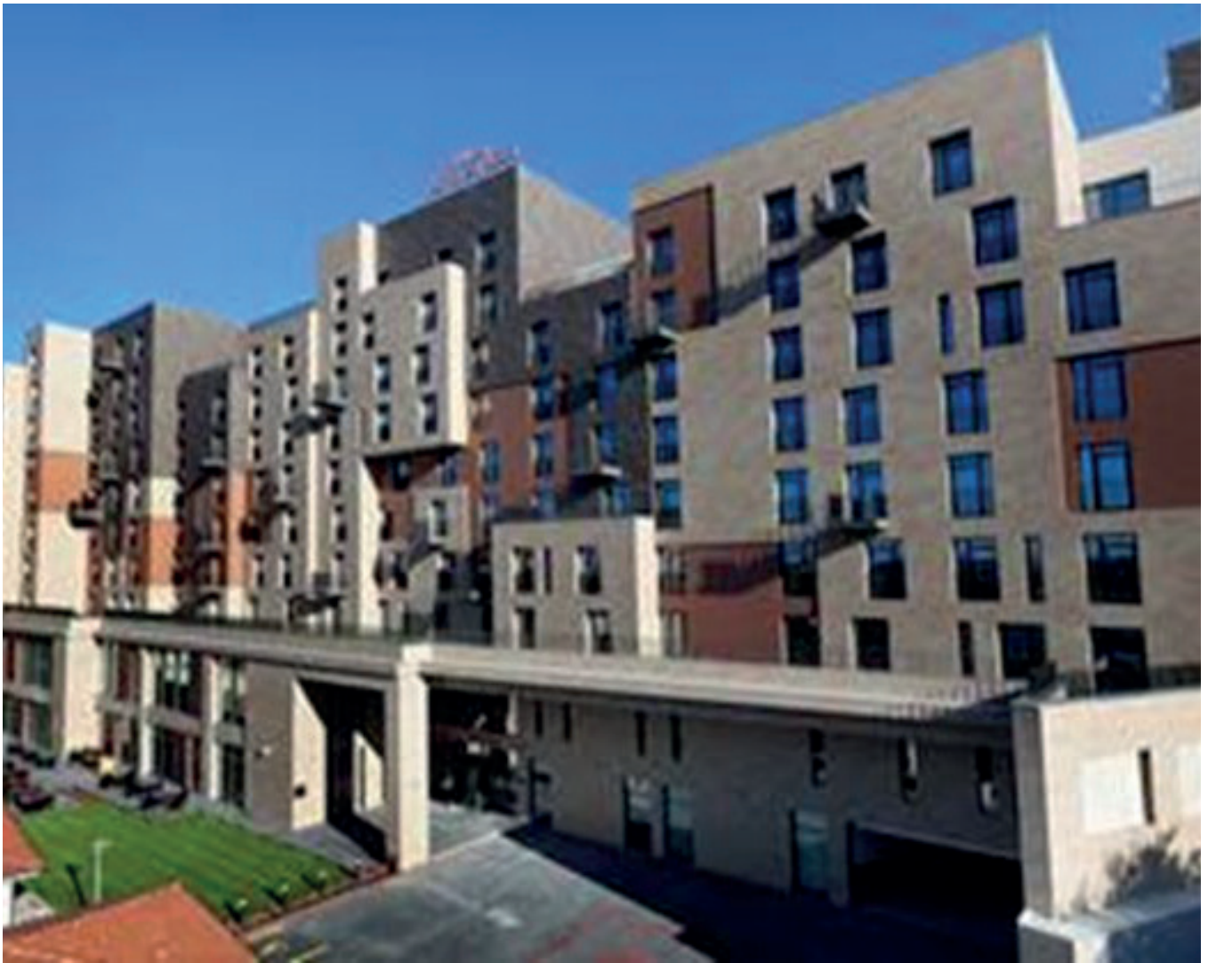
Hilton İstanbul Beyoğlu Sütlüce project of FERMAK Inc., which is among the companies VEO is cooperating with on projects basis