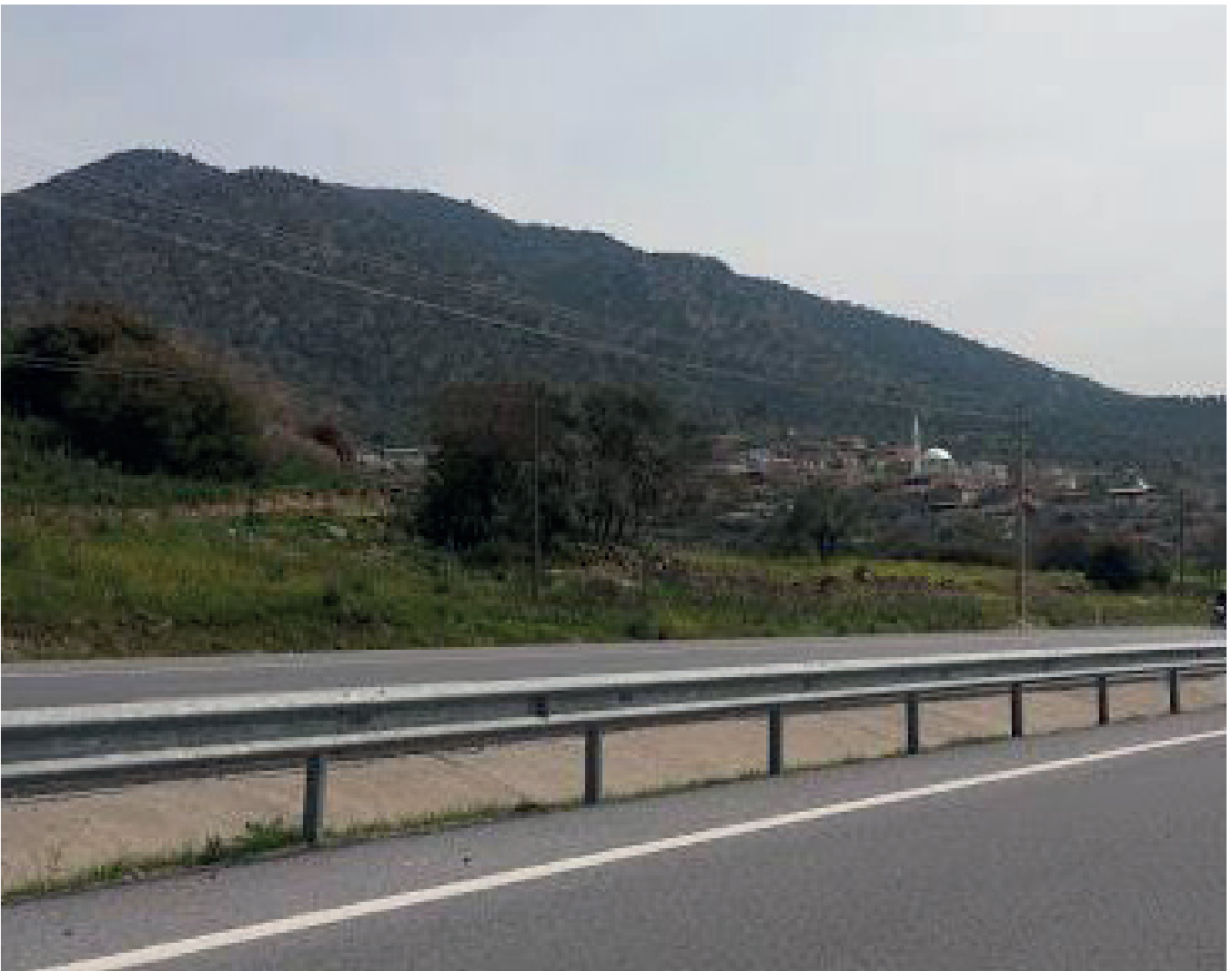
Aydın Çine Akçova exit road project of FERMAK Inc., which is among the companies VEO is cooperating with on projects basis