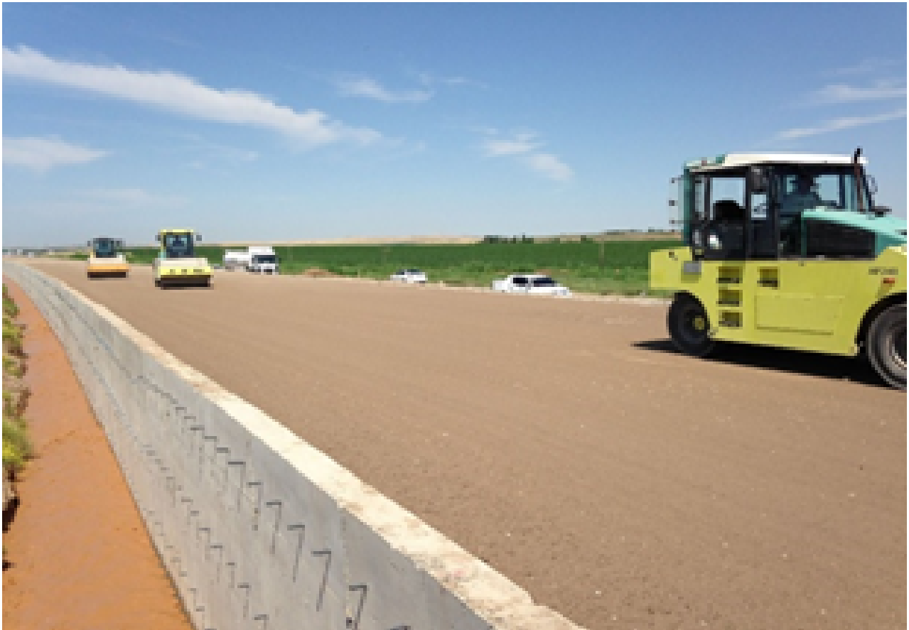
Bitlis Van Ahlat City Passage Road project of FERMAK Inc., which is among the companies VEO is cooperating with on projects basis