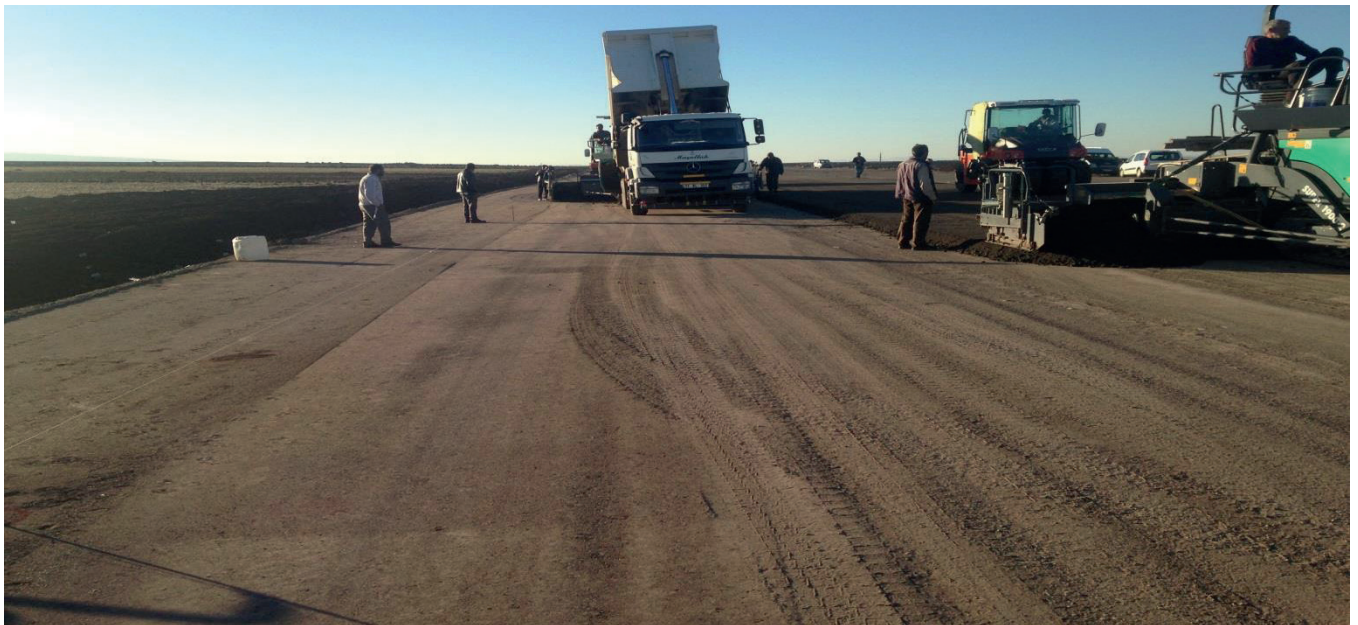
Diyarbakır Diversion Road project of FERMAK Inc., which is among the companies VEO is cooperating with on projects basis