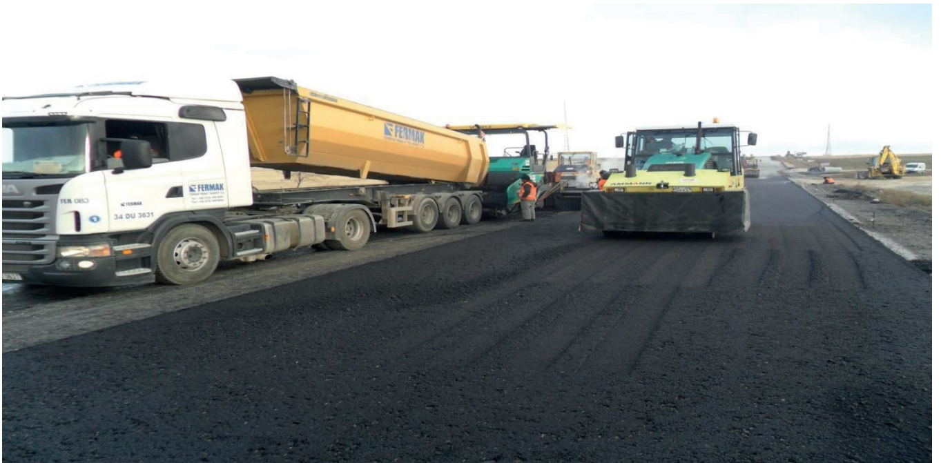
Ankara Bala and Bala Aksaray-Ereğli exit project of FERMAK Inc., which is among the companies VEO is cooperating with on projects basis